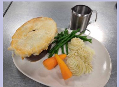
Nicole baked wild boar pie with mash and fresh seasonal vegetables