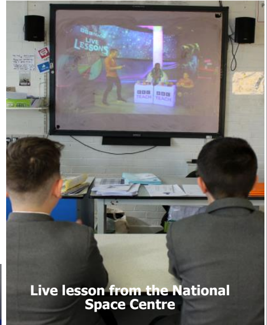
Live lesson from the National Space Centre

There were also scientific 'What am I?' riddles throughout the week for students to solve which was aimed at getting them thinking about all the wonderful ways different animals have adapted.