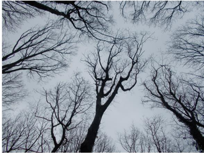
'Looking Down at You' by Willow in Year 7