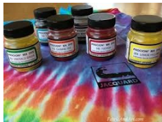
Cold water dyes